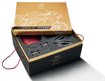
SUPERVELOCE 1000 SERIE ORO DEDICATED KIT BOX**