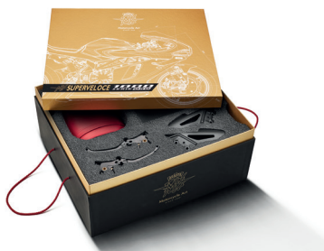
SUPERVELOCE 1000 SERIE ORO DEDICATED KIT BOX**