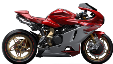
WITH DEDICATED KIT**